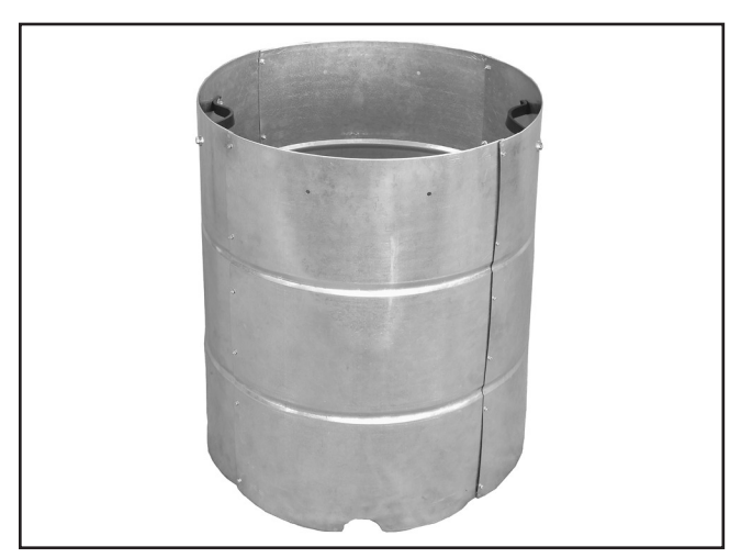
Figure 1. Model H8174 assembled.

If you need help with your new bag holder, call our Tech Support at: (570) 546-9663.